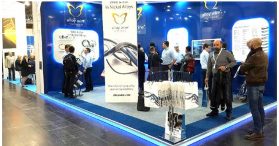
The amazing AWI stand at WIRE & TUBE 2016

Over 50 different metals – including the recently added Nitronic 50 x (0.025 to 5.50mm) and Super Duplex (0.025 to 6.50mm) – were on display at the new stand, which caused a lot of interest at the show. Visitors were impressed with the sleek design, clean look and the 55 inch touchscreen that allows you to look at the history of the business, the markets it serves and the expanding product range.